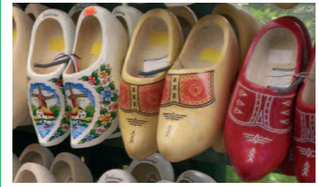
The 'Kingdom of the Netherlands' on the north western end of Europe, squeezed in between the North Sea, Belgium and Germany, is famous for their cultivation of flowers, their production of big wheels of cheese and their traditional wooden shoes. Some people still wear traditional wooden shoes, however, their wearers likely work in the tourism and entertainment industry.

Preparations for ICPM 2008 – the '15th International Conference on Pharmaceutical Medicine' – 7-10 September 2008 in Amsterdam, the Netherlands, are in full swing! One team is focusing on content while another is concentrating on logistics.